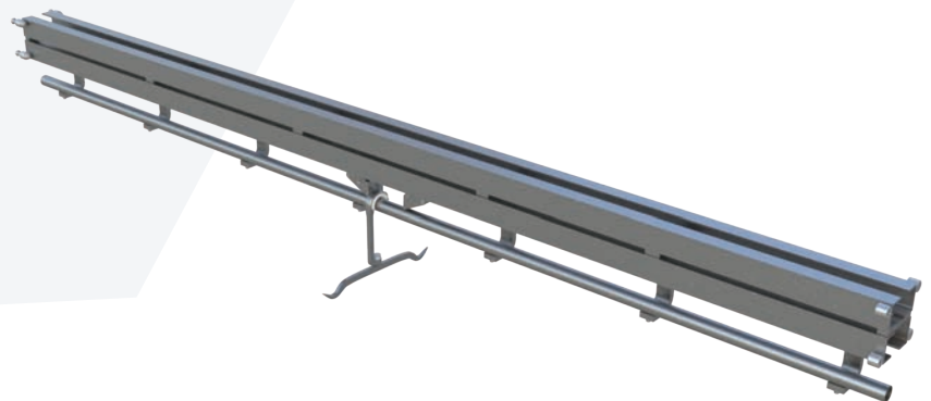
Duoplan conveyor with gambrel