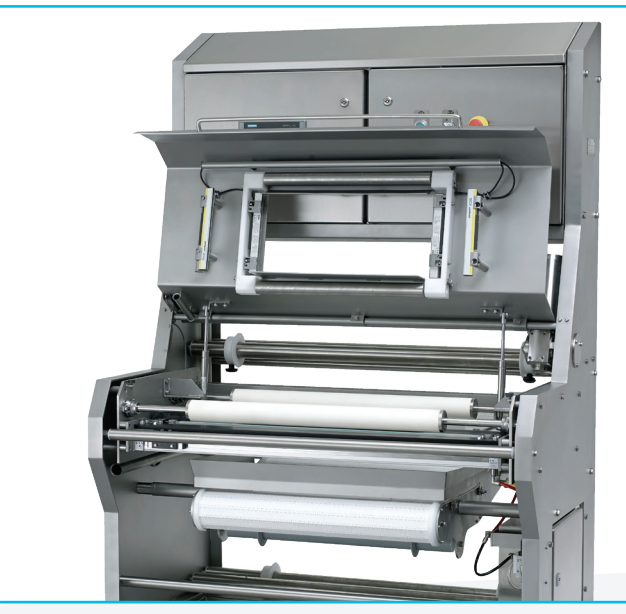
Easy access for film changing and cleaning